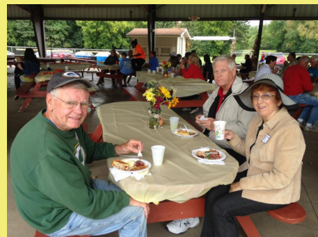
That's some tasty vittles!

We'd also like to thank the Okauchee Lions for donated their great facility for the day.